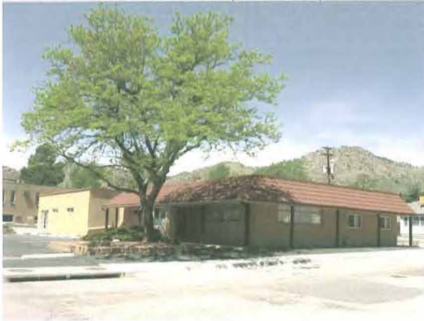
FRONT/SIDE VIEW (SOUTH/EAST)